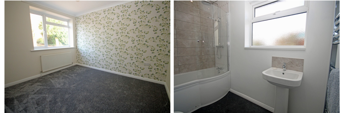
GROUND FLOOR 957 sq.ft. (88.9 sq.m.) approx.